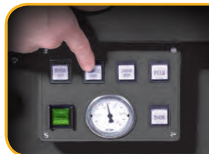
Air-Drops standard AIR-AFT

Cervical Thoracic Lumbar Pelvic Breakaway Thoracic release