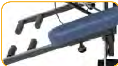
Patient Gripper Bar