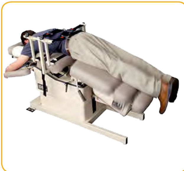
Hill AFT Scoliosis Treatment Package